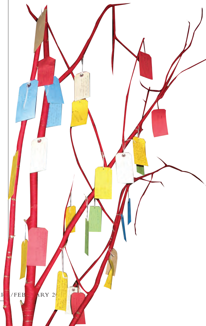
The Story Tree allowed workshop participants to share their tales with others