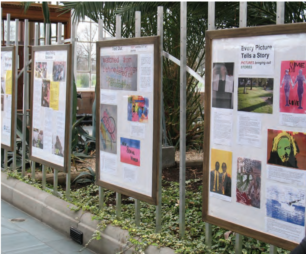
Winter Gardens 2007, an exhibition in the very public space of the Winter Gardens